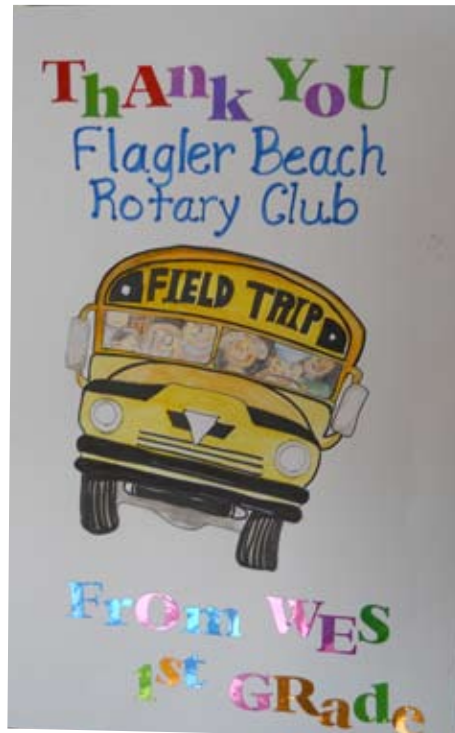
The cover of a Thank You Booklet from the WES Class that we helped so they could go on a field trip